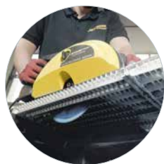
Ideal for cutting metal grids with LBS saw blade Art.: 608100LBS