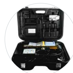
Delivery in carry case