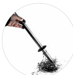
Optional: magnetic chip collector Ref. 490153