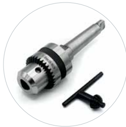
Optional: drill chuck 16 mm and adapter Art. 490164