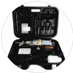
Delivery in a carry case