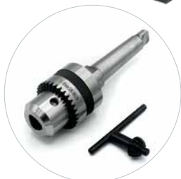
Optional: Drill chuck 16 mm and adapter Ref. 490164