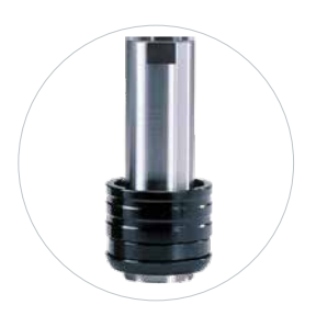
Optional: quick release chuck Ref. 490172