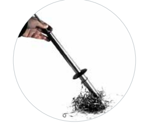
Optional: magnetic chip collector Ref. 490153