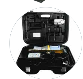
Delivery in carry case