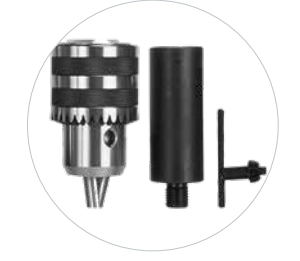
Optional: 16 mm drill chuck & adapter Ref. 490173