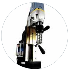
Generous stroke is easily adjustable