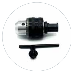
Optional: 13 mm drill chuck & Adapter for direct use in quick release chuck Art. 490152A