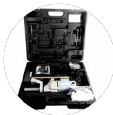
Delivery in a carry case