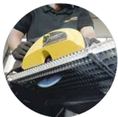
Ideal for cutting metal grids with LBS saw blade Art.: 608100LBS