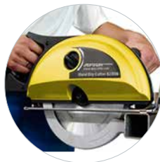
Cutting depth of 82 mm