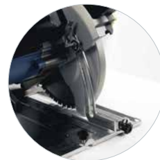
Depth adjustment with scaling