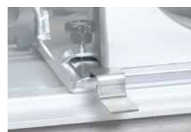
Set of 2 adapters for guide rail 1.400 mm Ref. 608275A