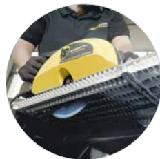
Ideal for cutting metal grids with LBS saw blade impact-resistant Ref. 608280LBS