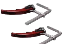
Quick release clamp for guide rail (2 pcs.) Ref. 608275S