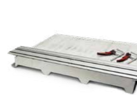
Guide rail SET Length 1.400 mm Incl. 2 quick release clamps Incl. 2 adapters (608275A) Ref. 608275ASET