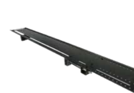
Cutting guide rail with integrated clamping system Length [mm] 600 - 1200 Ref. 608284