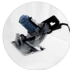
45° bevel cut