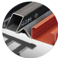
Optional: Guide rail 1.400 mm with 2 C-clamps 608275SET