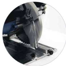
Depth adjustment with scaling