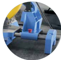
3-point locking For optimal sawing position

TWO PATENTED STABILIZERS FOR A BETTER CUTTING SURFACE AND LONG CUTTING LIFE