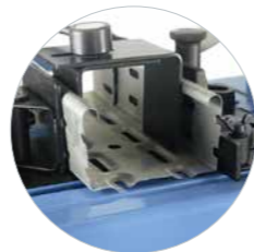
THINFIX CLAMPING SYSTEM For open profiles. Optional (Ref. 600546)